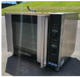
Moffat Turbofan Oven