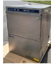
Electrolux Sterilizer Washer