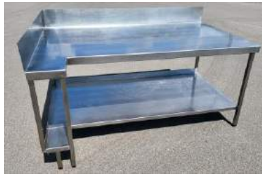
Stainless steelwork bench 1050 x 900