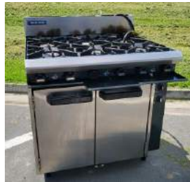
Blue Seal 6-burner gas stove